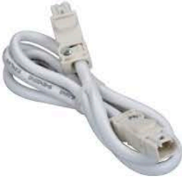
244358 / 244359