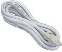
244356 / 244357